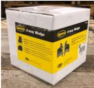
Product in package

SpeeCo® announces the recall of a 4-Way Wedge accessory for hydraulic log splitters.