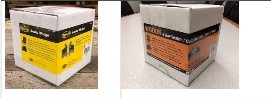
SpeeCo 4-way wedge packaging