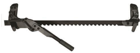
Recalled SpeeCo fence wire stretcher