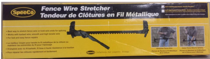
SpeeCo fence wire stretcher packaging